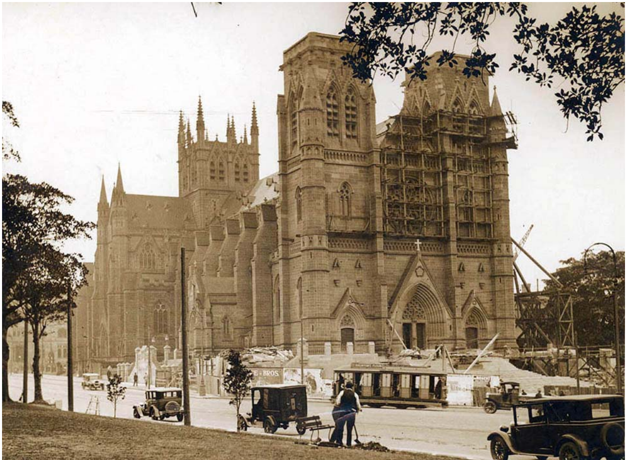
St Mary's Cathedral Sydney. Wardell's design of the cathedral towers included spires, but the spires were not completed until August 2000, 135 years after construction commenced

A significant number of Wardell's buildings are now on the National Heritage List.