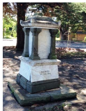
The Memorial at its unveiling ceremony in 1915, and how it appears today

An article appeared in the Shoalhaven News and South Coast District Advertiser on the 6 th February 1915. In the article, it describes the fountain as follows: