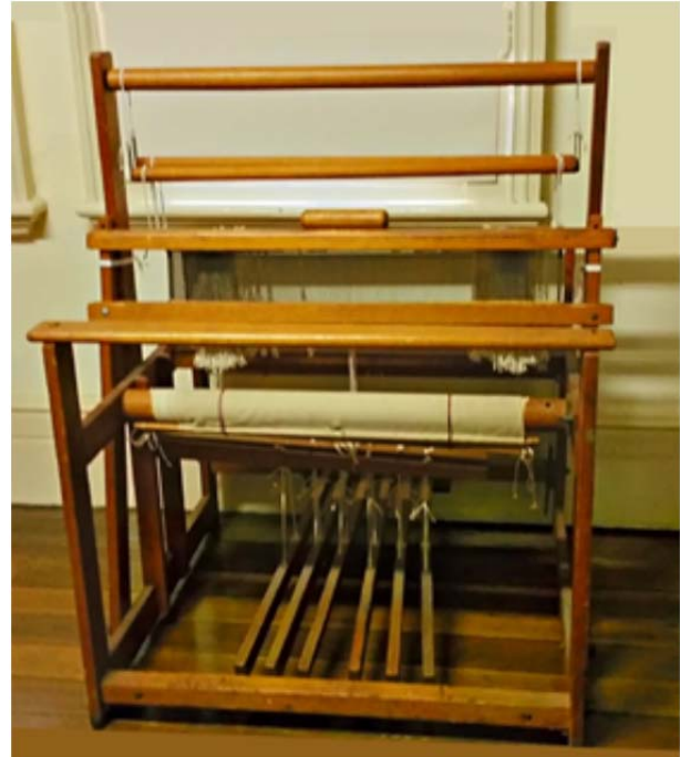
The loom in the Military Room

The loom is typical of the type of loom that was given to returned WWII servicemen to operate as part of 'craft therapy'. The returned servicemen had been traumatised by what they had seen and done during the terrible and shocking time they had spent on the front line and in support services.