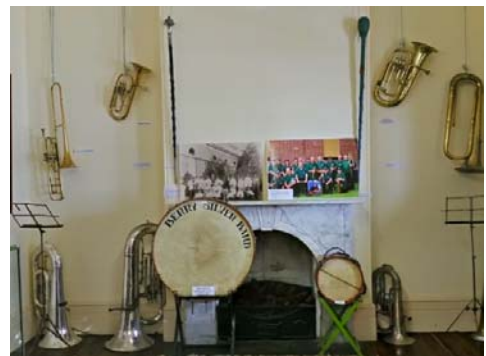
Berry Silver Band Exhibition at the Museum