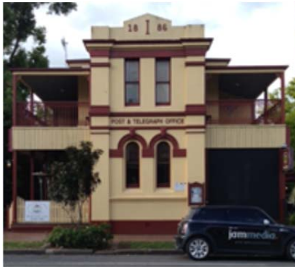
Post and Telegraph Office

The plaques are being made by Phoenix Foundry in Euralla, a firm recommended by the Royal Australian Historical Society. They will be fitted by a South Coast stone mason experienced in heritage work.