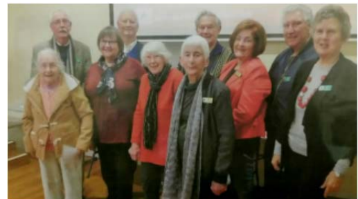
Some past presidents of the Berry Garden Club

In 1961, the Garden Club of Australia Shoalhaven Branch was formed. Several people from Berry were foundation members of this very active club. It was blessed with a number of members who were very knowledgeable in various facets of gardening and willing to share their knowledge.