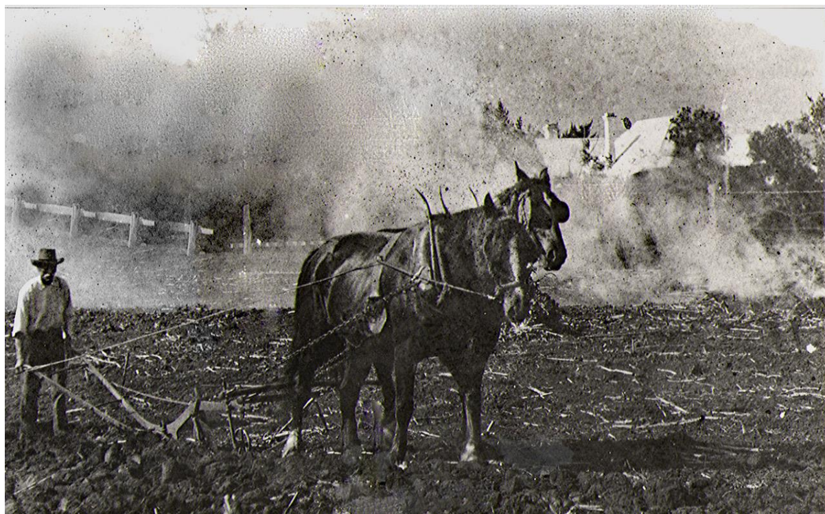
Ploughing on the Pulman Farm