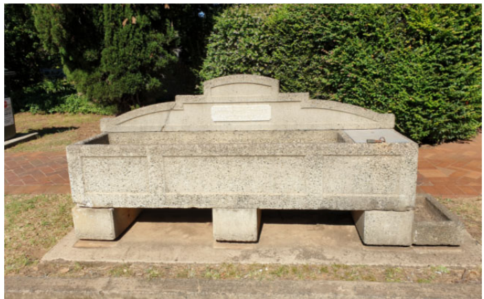
The horse trough at the entrance to Apex Park, Berry